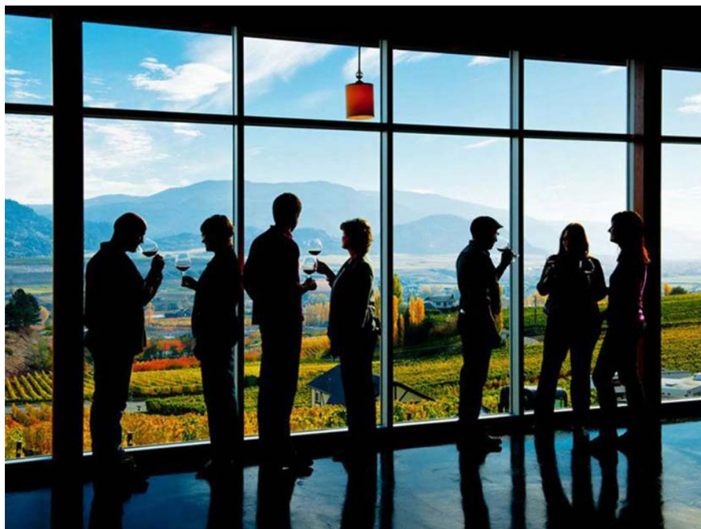
143 B.C. wineries entered the 16th WineAlign National Wine Awards of Canada in 2016.

ANTHONY GISMONDI Updated: March 20, 2017